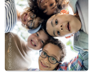
HOW INHERITANCE TAX WORKS

Making a will is the essential first step of an effective estate plan